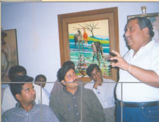
Fevicol sales team learns the realities of the marketplace